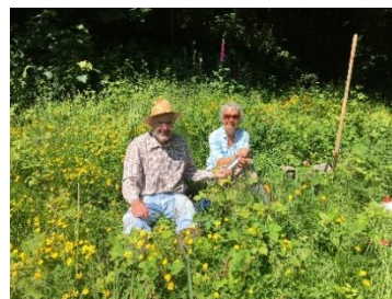
It's not all hard work! Nid yw'n llafur caled i gyd!

The Group depends on volunteer members. The Group has a committee of members elected at the Annual General Meeting with representatives of the Newport Town Council and PCNPA. The Council and PCNPA support the Group. Anyone is welcome to join and take part. To join or for more information please contact one of us: