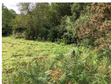
Balsam pulled Jac-y-Neidiwr wedi ei dynnu