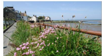
NEWPORT PARROG TO CWM

Ar gyfer y rhai sy'n hoffi rhywbeth hawddach, trefnodd y Grŵp Daith Gadair Olwyn rhwng Y Parrog â'r Cwm gyda phaneli hysbysrwydd a thaflen mewn orgraff fawr a Braille.