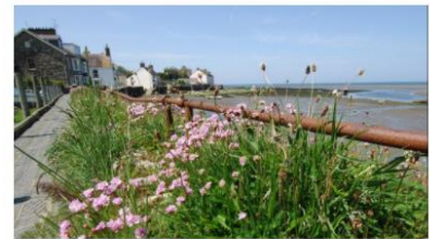
NEWPORT PARROG TO CWM

Ar gyfer y rhai sy'n hoffi rhywbeth hawddach, trefnodd y Grŵp Daith Gadair Olwyn rhwng Y Parrog â'r Cwm gyda phaneli hysbysrwydd a thaflen mewn orgraff fawr a Braille.