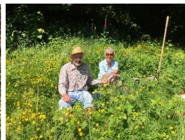
It's not all hard work! Nid yw'n llafur caled i gyd!

The Group depends on volunteer members. The Group has a committee of members elected at the Annual General Meeting with representatives of the Newport Town Council and PCNPA. The Council and PCNPA support the Group. Anyone is welcome to join and take part. To join or for more information please contact one of us: