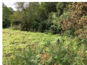
Balsam pulled Jac-y-Neidiwr wedi ei dynnu