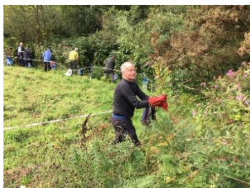
Pulling balsam Tynnu Jac-y-Neidiwr

https://www.pembrokeshirecoast.wales/conservation/invasive-non-native-species/himalayan-balsam/